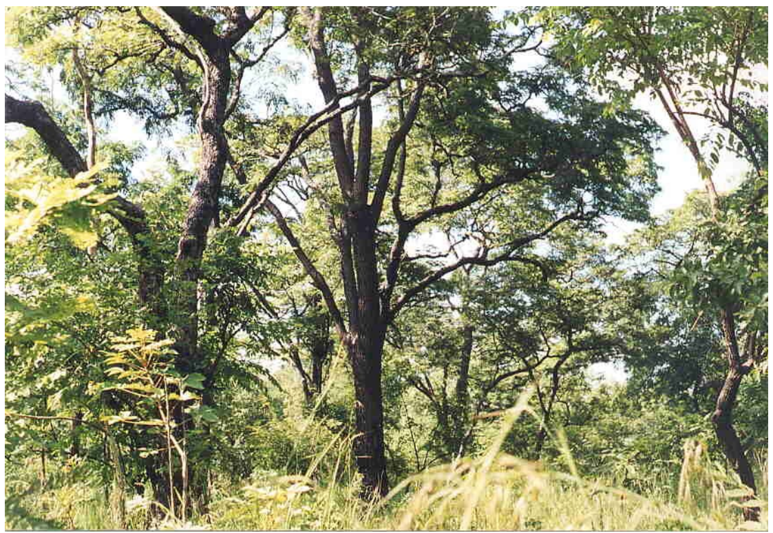
Miombo woodland in Sofala Province, Mozambique